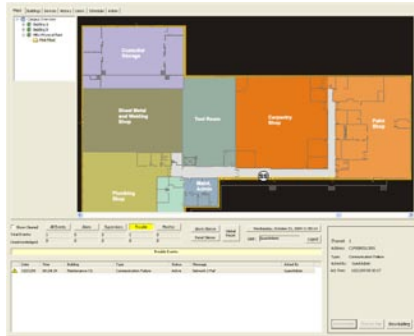
Typical Screen shots showing campus view as well as building floor plans